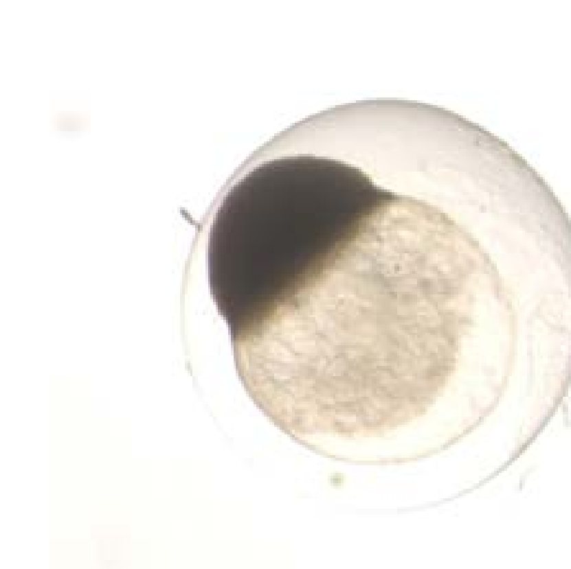
Figure 3: High Blastula Embryo (Stage 10). Amy Snow, August 7, 2014.