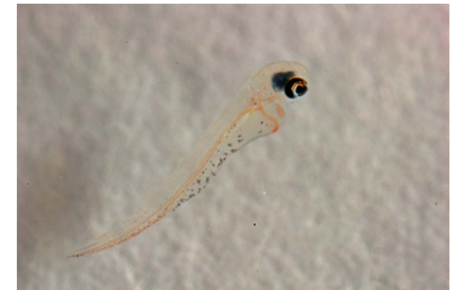
Figure 4: Fathead Minnow Larvae. Michael Patnaude, October 2, 2009.